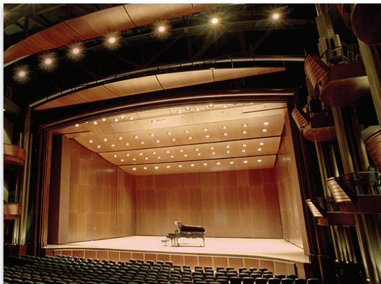
Ferguson Center for the Arts, Christopher Newport University, Newport, Virginia