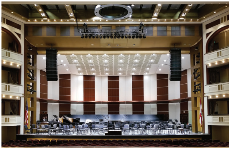
Mahaffey Theater, St. Petersburg, Florida