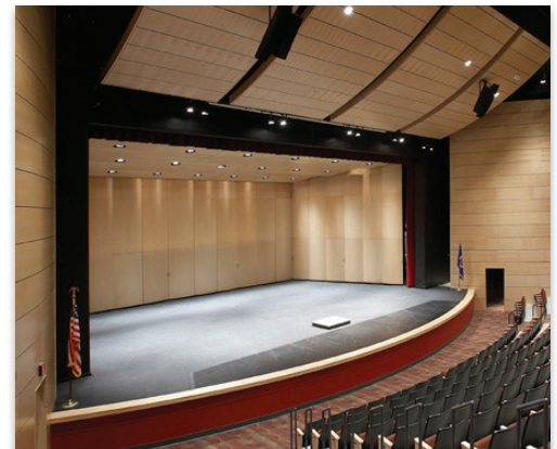
Watertown-Mayer High School, Watertown, Minnesota