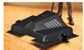
Diva's Air Transporter moves towers on a cushion of air.